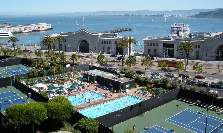
GOING, GOING, GONE?—The City's only outdoor tennis and swim facility is facing destruction if the current course of events continues. The San Francisco Board of Supervisors gave preliminary approval to the 8 Washington project May 15.

Although there are many more actions and votes that must be taken before pile drivers go into the ground at 8 Washington, the developer received a significant boost when the Board of Supervisors voted 8-3 on May 15 to support the Environmental Impact Report (EIR) and Conditional Use (CU) agreement for the project.