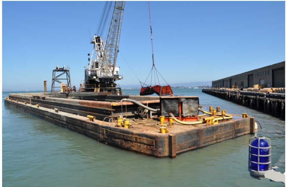
PIER 27 PREP —Dredgers slide in to remove bay mud for the big cruise ships that will be berthing along Pier 27 at the new Cruise Terminal.

The system will reduce emissions by allowing ships berthed in the drydock, a