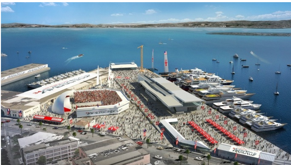
AMERICA'S CUP, THEN CRUISE TERMINAL —This rendering shows Pier 27 in full America's Cup grandeur. It will later become home of our new Cruise Terminal.